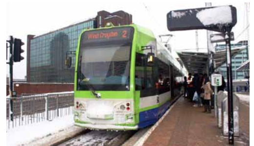
LRT in London, UK

Only this month in London, UK despite winter conditions that led to severe disruption on the roads for cars and buses and canceled rail services, Croydon LRT continued to run.